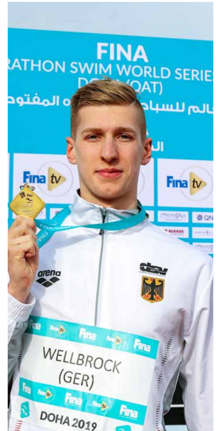
Florian Wellbrock - European Champion

"It was my first time in Doha and I would like to come back here."