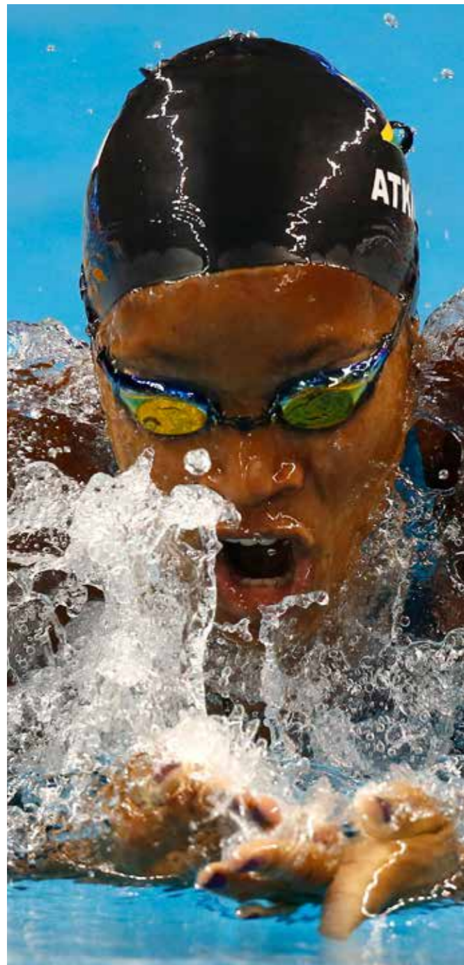
Alia Atkinson - World Champion

"Doha is one of my favourite venues and I love to compete here."